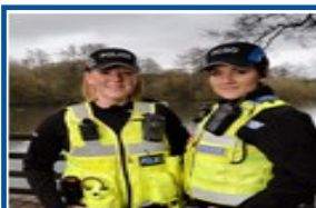
Police officer—a person who helps people to follow the