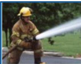
Fire-fighter—a person who stops fires.