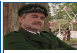
Park keeper—a person who keeps the park clean and safe for the public.