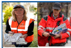
Postal worker—a person who delivers letters and parcels to