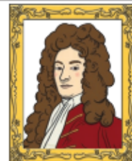
Sir Christopher Wren